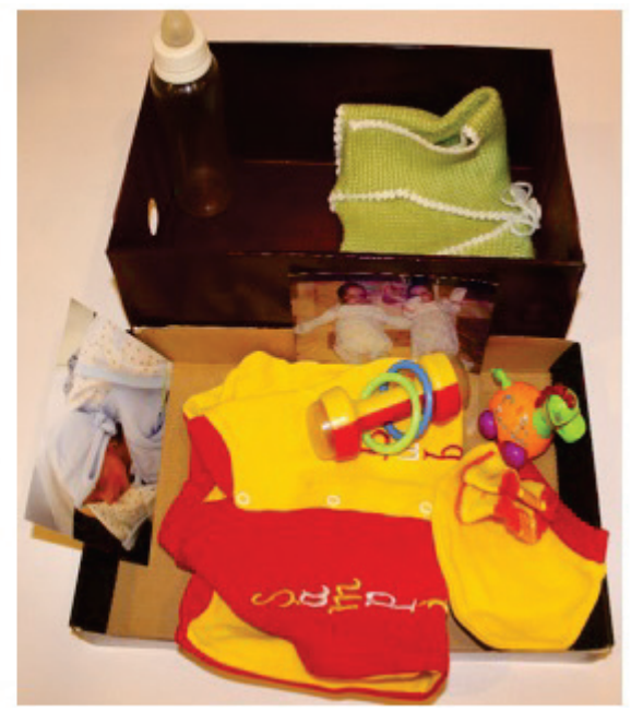
Figure 4. Example Time Capsules