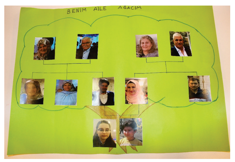
Figure 2. Example Family Tree

The third important contribution of oral history activities to students was learning how to make a family tree. In this study, the photographs of each family member were glued to the relevant branch on the hierarchically-prepared tree. An example of a family tree prepared by a student is given in the following photograph: