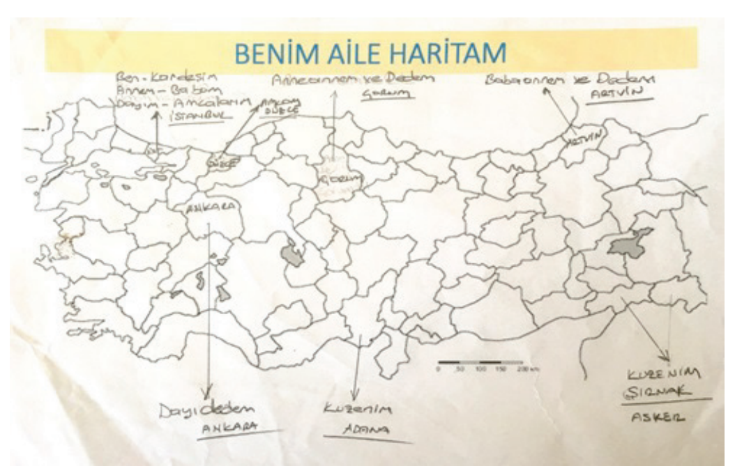
Figure 1. Family Map of Yakup

The second important contribution of oral history activities to students was that they learned where their families came from and where they migrated to. Students were given the Family Map activity for them to learn this information. In this context, they were given blank maps of Turkey and asked to ask their family elders from where and in which year they came to Istanbul. The students filled this activity in with their parents and grandparents. It was also seen that the students marked on these maps where their relatives have been to in Turkey and they noted down on the outer parts of the maps their purpose. An example of these maps is presented below: