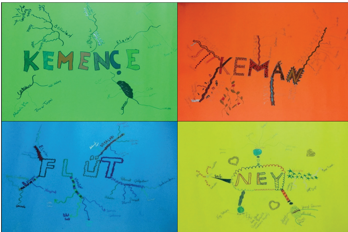
Figure 2. Examples of Mind Maps Prepared by Students

As the courses were instructed along the designated plans, students attended to these courses by preparing beforehand. Students in the groups prepared mind maps in cooperation with other students in their group. Students tried to see and understand the subject on their mind maps as a whole.