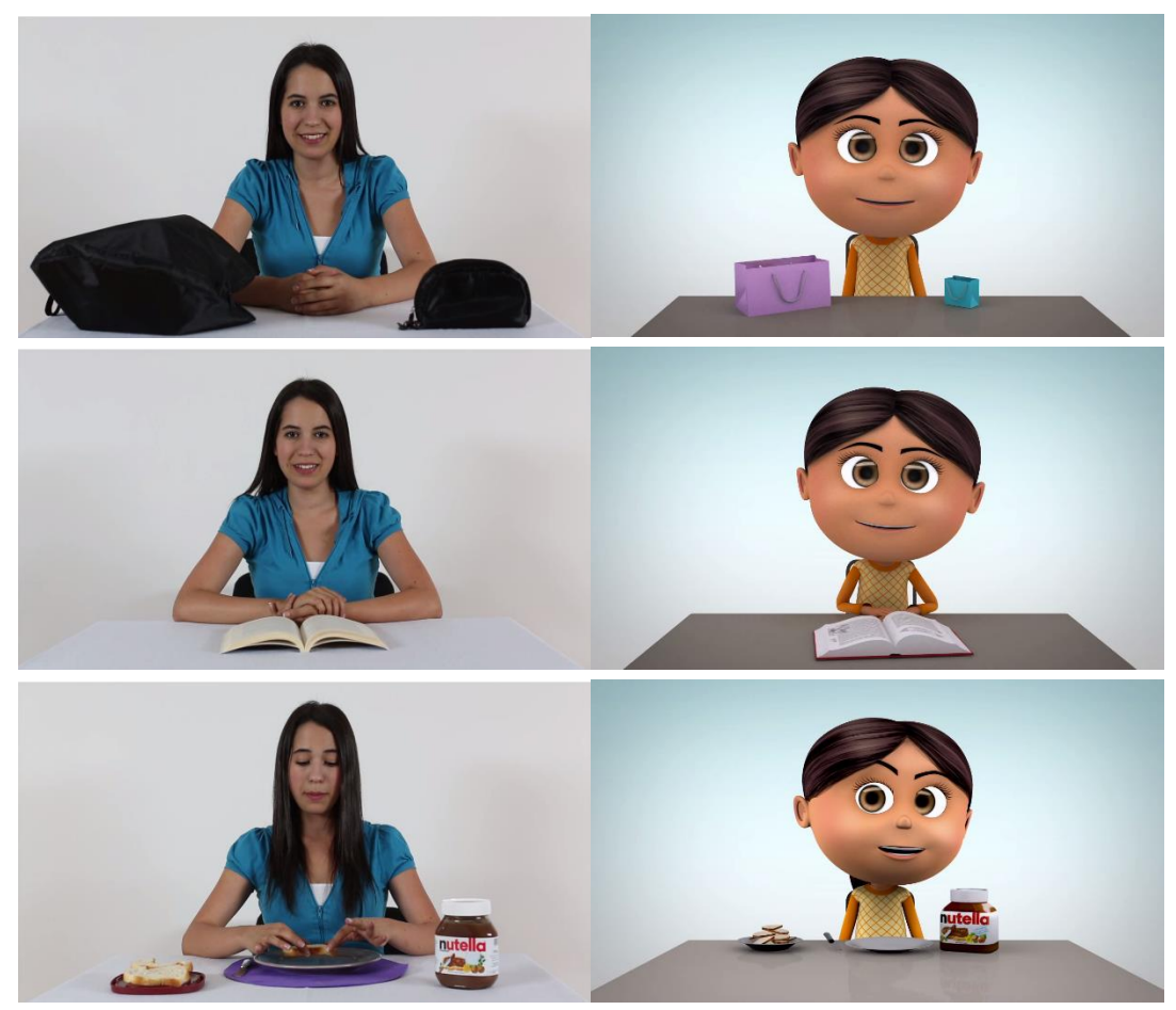
Figure 1. The Models Used in Which Bag, Henna Lamb, and Chocolate Bread Videos

Tobii Studio 3.2: Eye tracking data from study participants were collected using Tobii Studio 3.2, an eye movement analysis program. Eye movements in Tobii Studio 3.2 software are determined using pupil/corneal reflection techniques. The software converts the receiver's and the monitor's reflective infrared cameras' eye movement data into visual and quantitative data, such as a heat map, and displays it to the user. The software offers the opportunity to record the image of the computer screen, the participant's eye movements, and the screenshot during the application. This recorded data can then be used to analyze the participant's visual attention and eye movements, giving researchers valuable insights into their behavior and preferences.